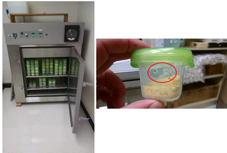
Fig. 1 Environmental chamber and sample containers. This figure depicts the environmental chamber loaded with sample containers as well as a close-up view of a container. Note the two 0.318 cm holes (red circle) drilled in the container to allow for contact of the ingredient with the chamber environment